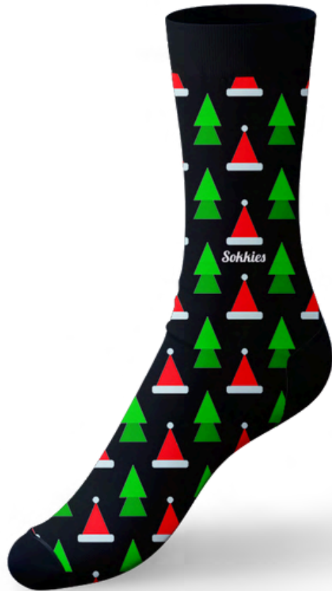
Christmas tree 1

All designs can be customized to incorporate your logo or corporate identity.