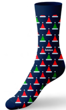
Santa hat 2