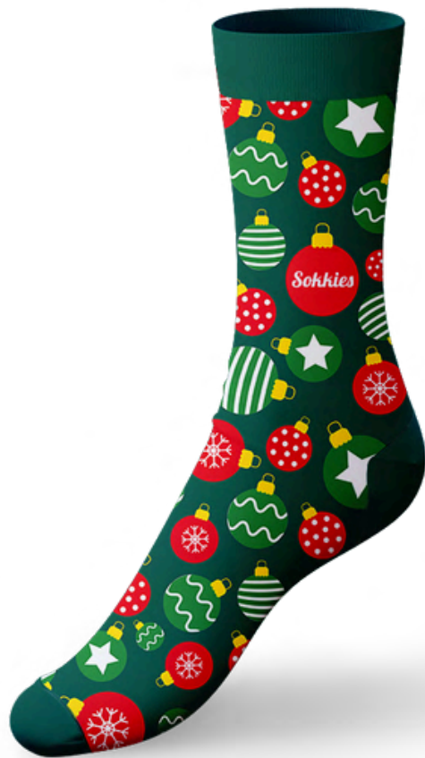
Christmas ornaments 1