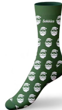
Santa Claus 2