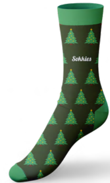
Christmas tree 4