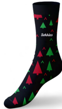
Christmas tree 5