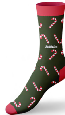
Candy Cane 2