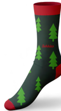
Christmas tree 3