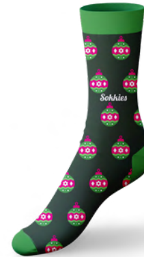
Christmas ornaments 2