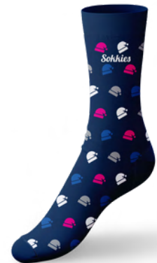
Santa hat 3