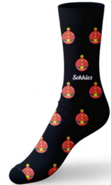
Christmas ornaments 3