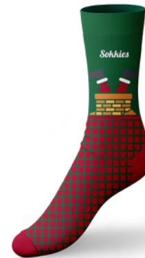
Santa Claus 4