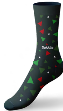
Christmas tree 2