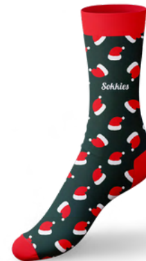
Santa's hat 1