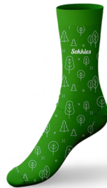
Christmas tree 6