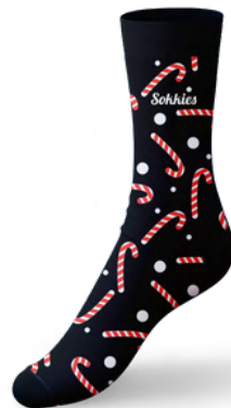
Candy Cane 1