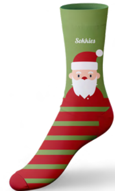
Santa Claus 3